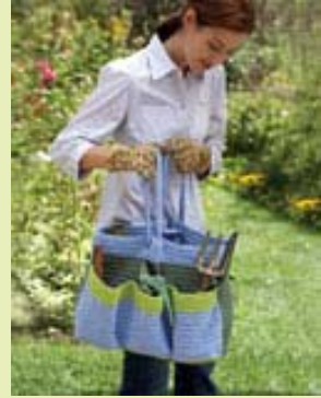
Garden Tote Bag

There's so much to be inspired by in nature. Don't forget to hold onto that inspiration while you can. Enjoy the seasons and keep crafting.