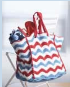
July 4th Tote Bag

Have a wonderful 4th of July. Enjoy your summer, keep cool, and keep crafting.