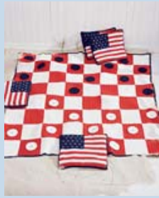
Checkerboard Picnic Blanket