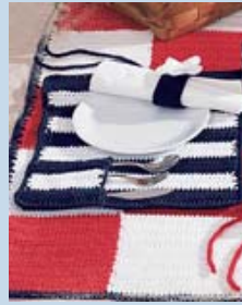
Roll and Go Placemats