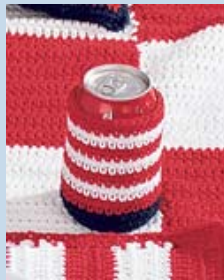
Beverage Can Holder

Have a wonderful picnic this 4th and make these eight great patterns to keep things festive. The BBQ apron, with a pouch for utensils is great for the chef and the chef's assistants. Make festive can holders to keep drinks cool on a hot day. With a picnic blanket that doubles as a giant game of checkers, comfy flag cushions, and red white and blue place settings, you'll be celebrating in style! To bring supplies to and from the picnic, don't forget to bring one of these great patriotic bags.