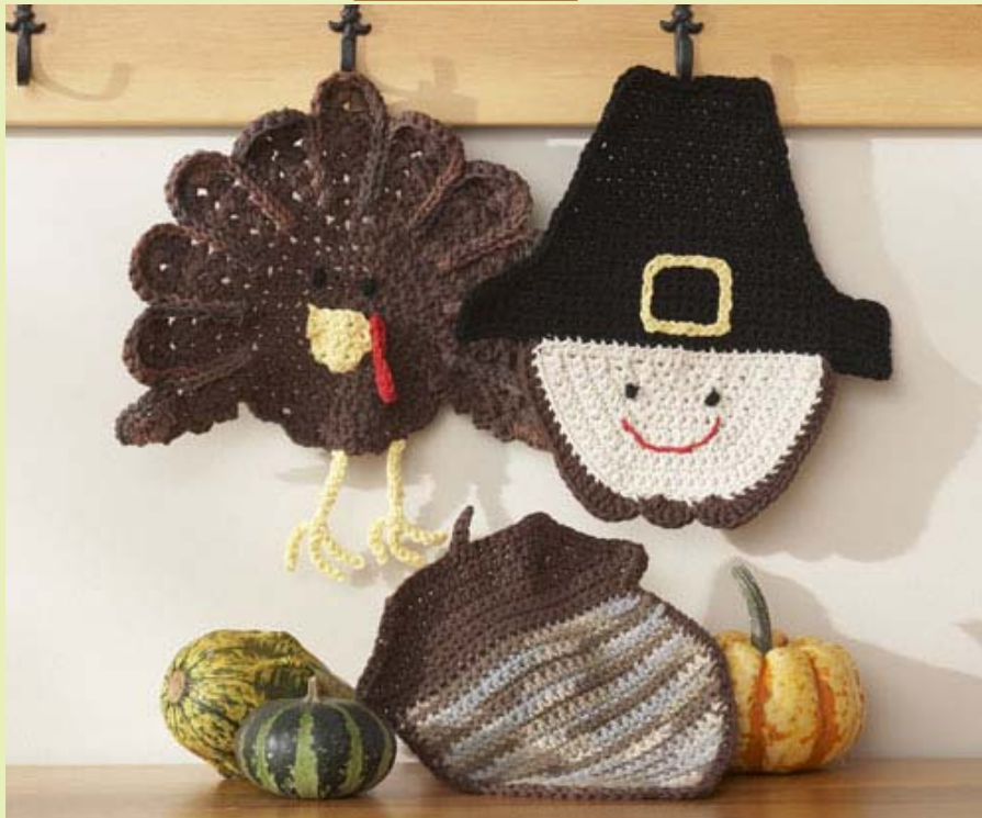
Turkey Dishcloth (crochet) Pilgrim Dishcloth (crochet) Acorn Dishcloth (crochet)

We wish you and your family a delicious Thanksgiving holiday. Make sure to help yourself to an extra slice of pie.