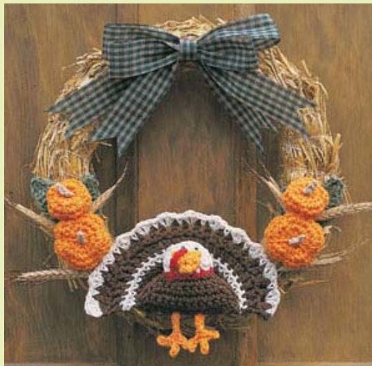
Thanksgiving Wreath (crochet)

It's late fall - time to celebrate the harvest and give thanks. Whether you're cooking up a giant bird for your cousins twice-removed, traveling across the country, or just having a simple dinner at home, Thanksgiving is a wonderful time to stop and appreciate the people around you. It's also the ideal time to notice the small things - little details that say 'I care' and 'thank you'. Decorations made from Lily@ Sugar'n Cream® are a great way of putting some extra thought and effort into the holidays. If you're looking for design ideas to keep everyone smiling through the season, read on for inspiration.