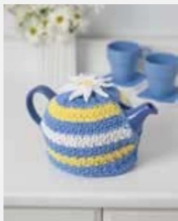
Daisy Tea Cozy

Another e-newsletter exclusive, enjoy these tea cozy patterns that will keep you crafting all spring. The Daisy Tea Cozy brings bold stripes in an invigorating spring palette to brighten your kitchen. The Pretty Pansy Tea Cozy is adorned with lovely springtime flowers. The Tea Cozy and Egg Cozy in pastels are perfect for Easter.