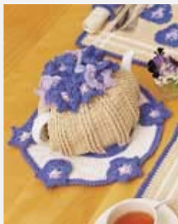
Pretty Pansy Tea Cozy