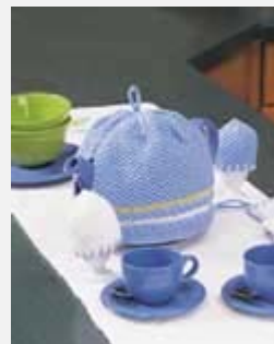
Tea Cozy and Egg Cozy